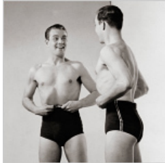
Does This Swimsuit Make Me Look Fat?