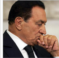
Room for Debate: Egypt's Stability, Mubarak's Trial