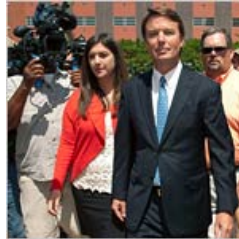
A Recurring Role as Family Glue