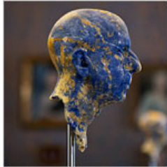
Artists Decorate Palazzos, and Vice Versa