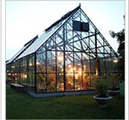
The Decorated Shed