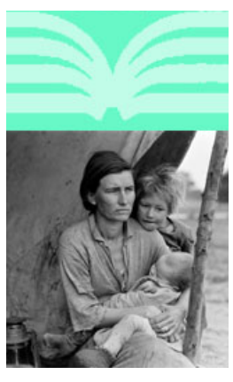
MORE FROM ESSAYS